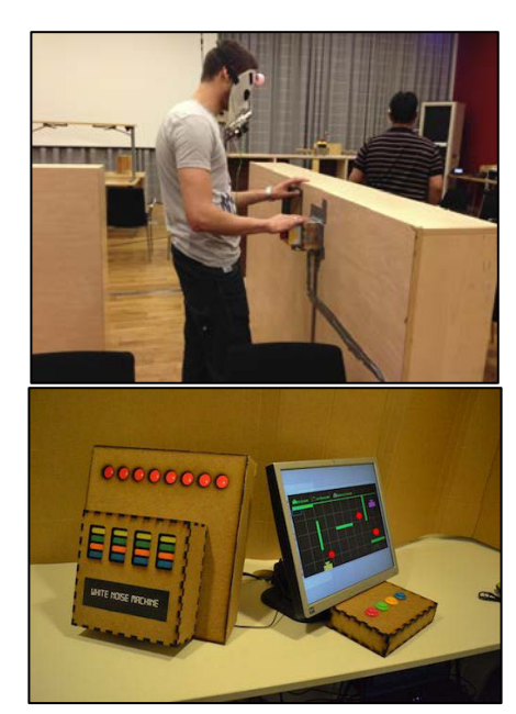
Figure 2. Top: Testing at the Bunker after a game session. Bottom: In the Control Room.

During the public play event called Malmö Playdays at the Malmö City Library, we made a series of playtesting sessions, where we fine-tuned small details in the game. The event ran from 11.00 to 16.00 with 8 groups of 4-5 players. The participants were either visitors or organizers within the Malmö Playdays, or random visitors at the library. Primarily these were people between 20 - 35 years old.